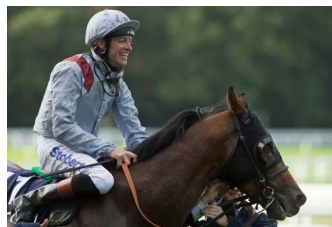
Olympic Glory Racing Post

In many ways, the owners of these two horses exemplify the all-encompassing reach of an agency that