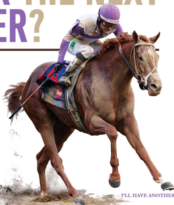
I'LL HAVE ANOTHER